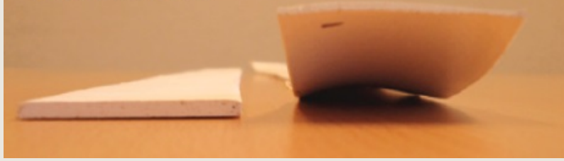
TABLE 1: RESULTS OF APPLICATION ON NON-POROUS SUBSTRATE

Anquamine 735 Self-Leveling Formulation (left) compared to a typical waterborne system (right) which exhibits shrinkage on non-Porous Substrates