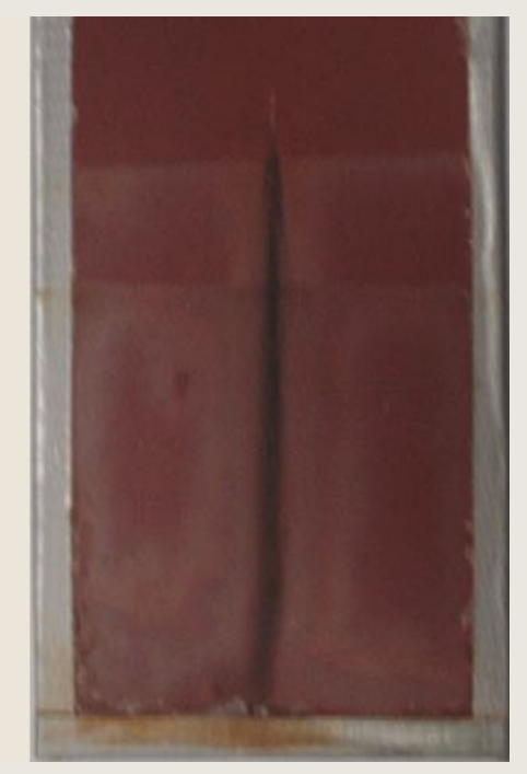
Ancamide 351A curing agent