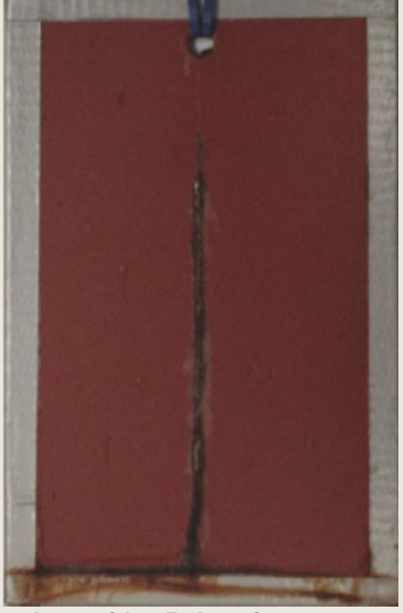
Ancamide 351A curing agent